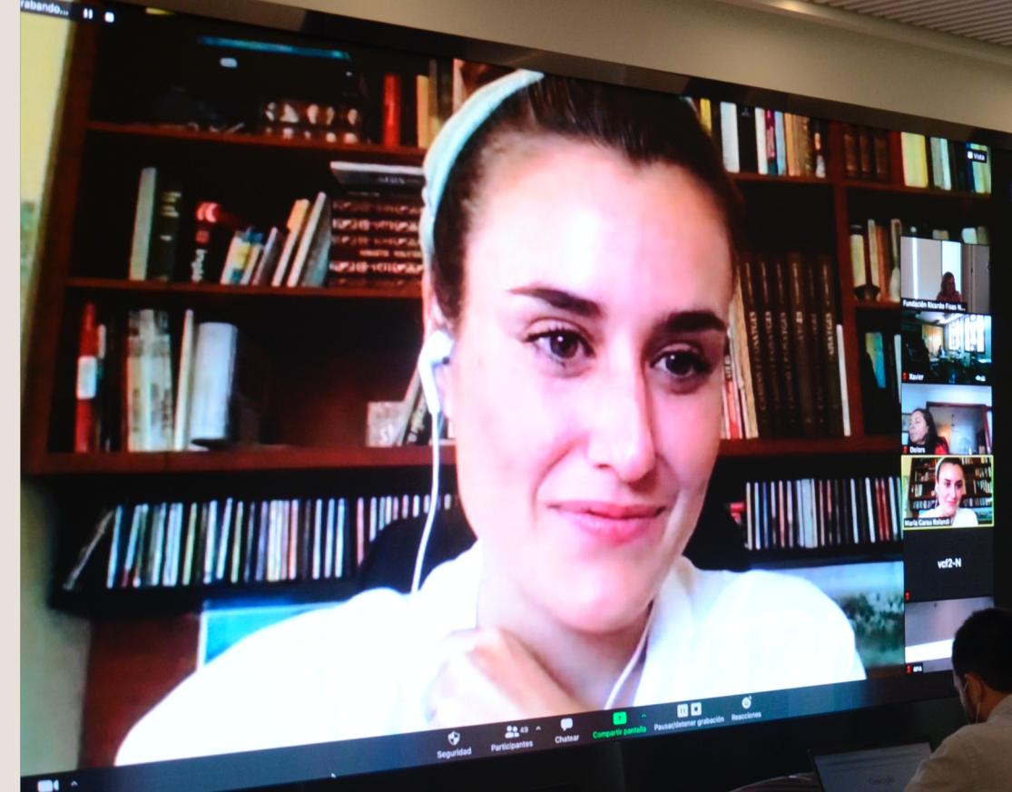
Virtual training in September 2020

A big thank you to all the schools that have chosen to train their teachers and management team during such a difficult year.