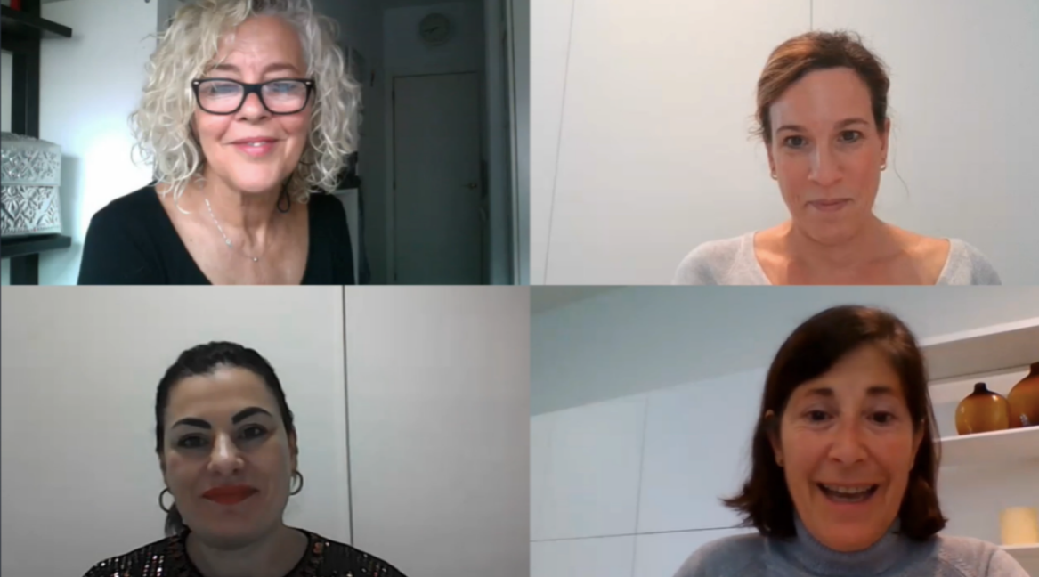
Round table during virtual training in October 2020