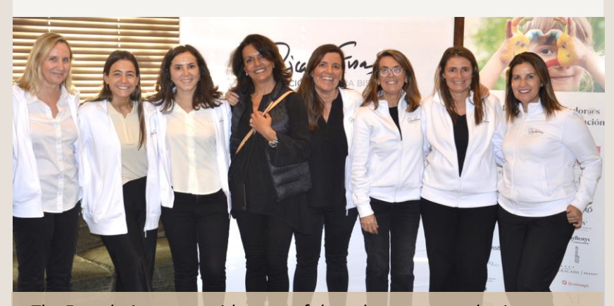
The Foundation team with some of the volunteers at a charity event